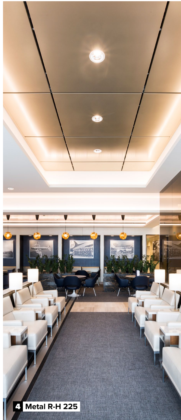
4 Metal R-H 225