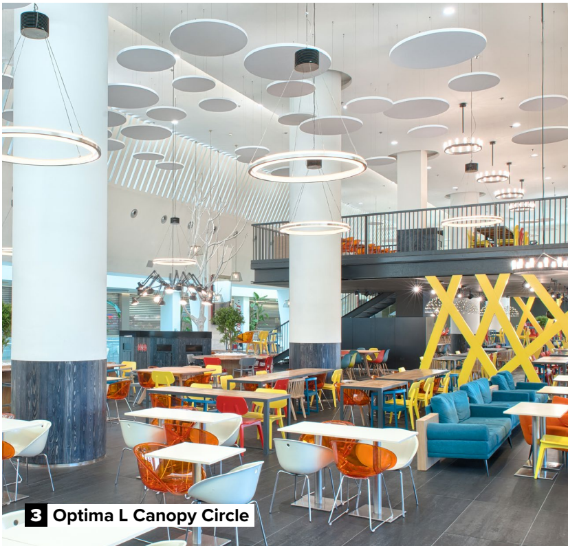
3 Optima L Canopy Circle