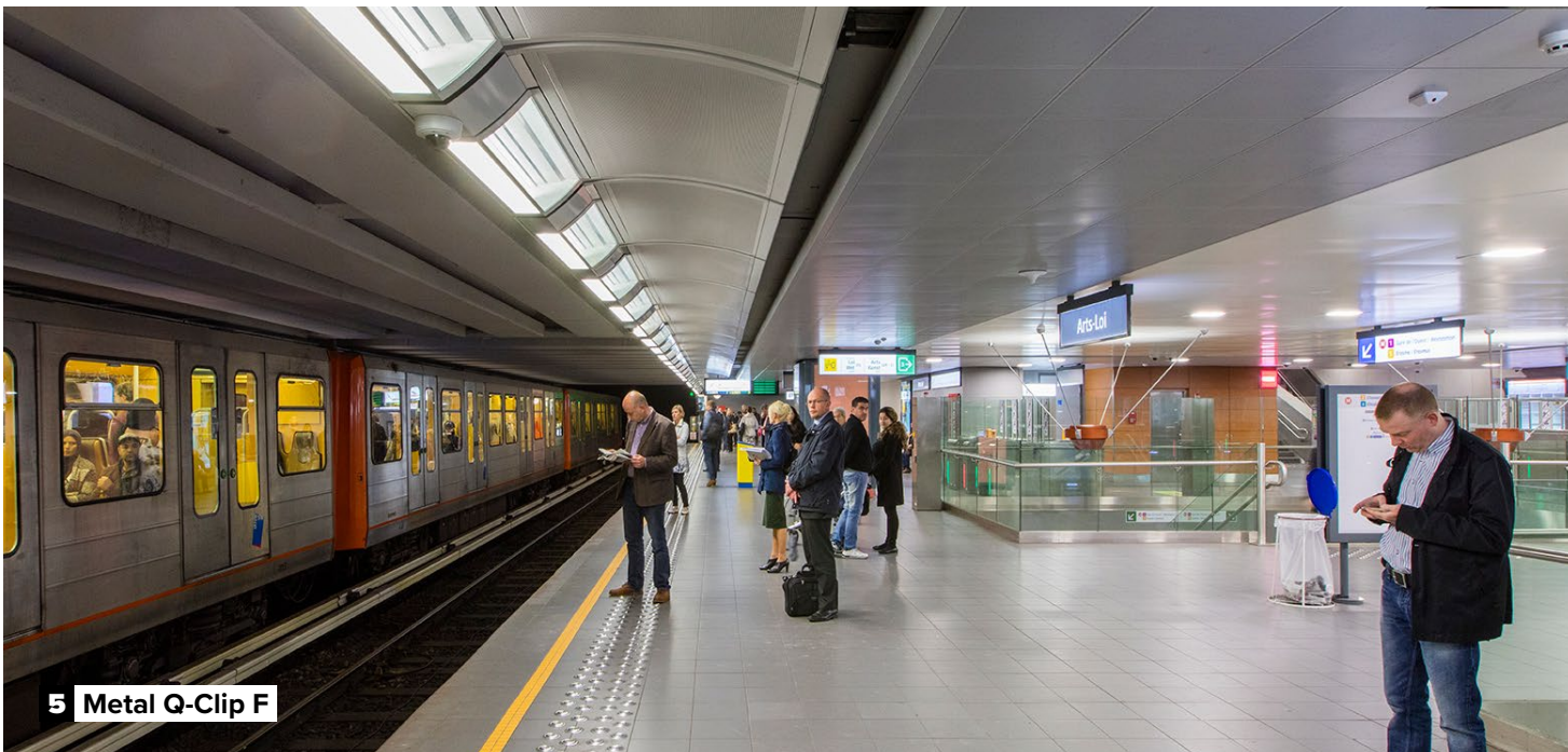
5 Metal Q-Clip F